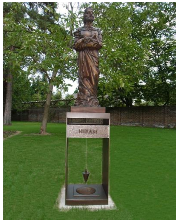
(Bronze Statue "Hiram", builder of the Temple of Solomon by Nikolaus Otto Kruch)

Hiram Abiff being such a significant figure in Masonry it is important that we not only learn about Hiram Abiff and who he was but to also learn the moral behind this legend. Personally as two Fellowcraft’s writing this and not knowing of the third degree we believe that the moral of this story is to stay true to your own beliefs and teachings in Masonry and life even in the face of despair.