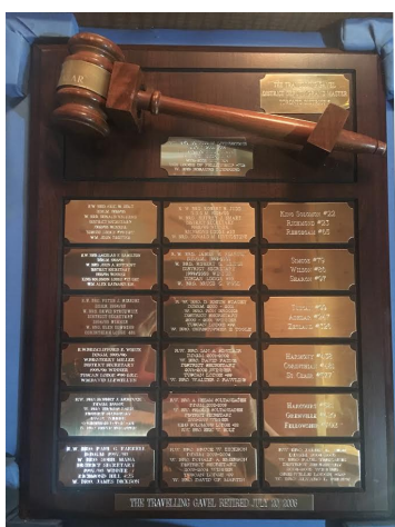
The Lazar Travelling Gavel

His masonic travels really increased when he suggested to the boys in District 5 that the best way to engage the brethren and increase visitations is to create a competition of it. He called it the 'Travelling Gavel' and you earned it by the